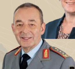
General Carsten Breuer Inspector General