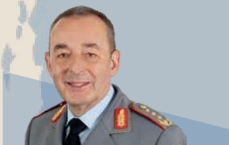
General Carsten Breuer Inspector General of the Bundeswehr